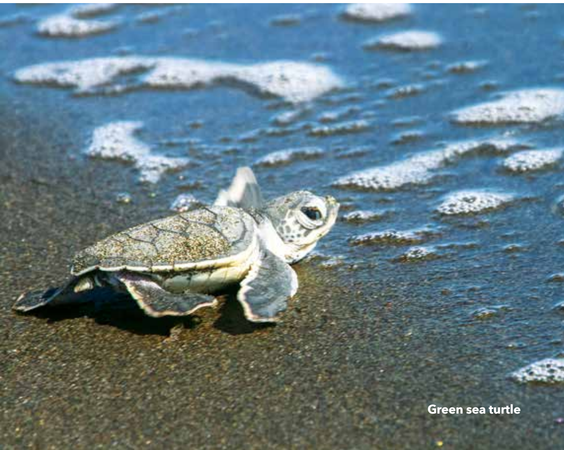
Green sea turtle

The downside of having a president designate a protected area is that another president can remove some of the protections, as Donald Trump did last summer when he allowed commercial fishing to resume there. Both Mystic and New England Aquariums have been vocal in their support of re-instituting full protections, from issuing media releases to assisting their members and visitors in sending thousands of postcards and letters to their legislators.